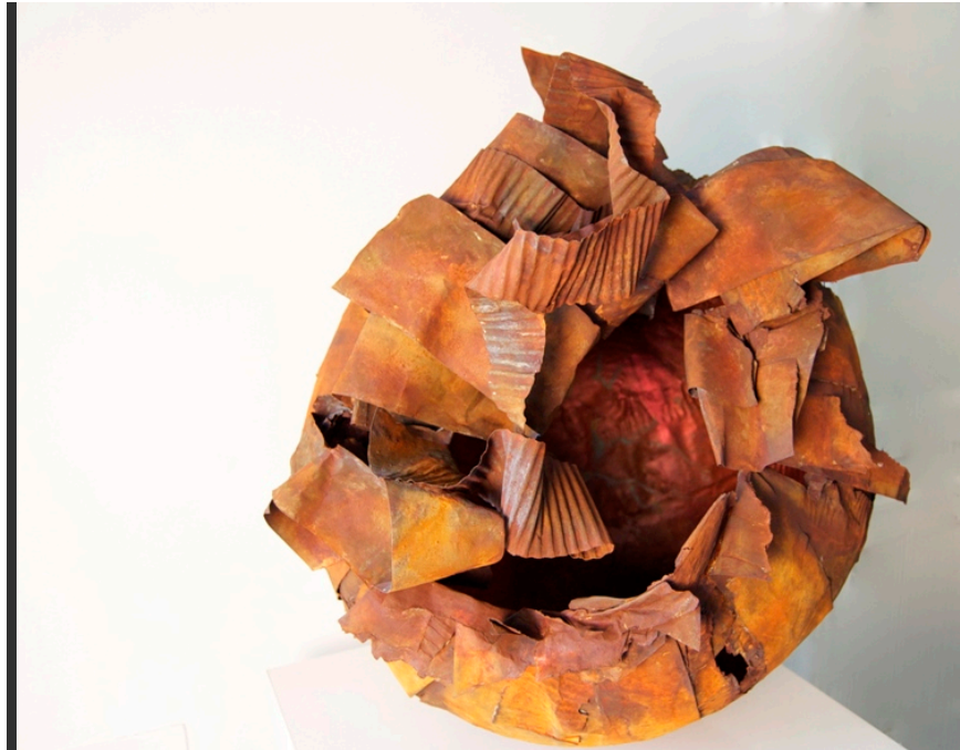
By Artemis Herber

ArtscapeBaltimoreDissolution & Transformationissue226MAXgallery